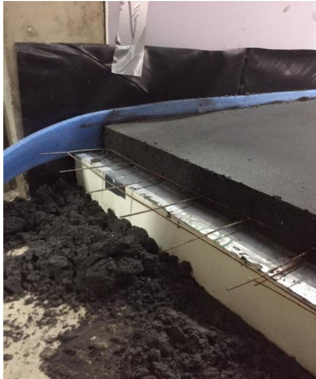
Figure 5 - Insulation of Screeded floor

The Kingspan is installed between two layers of cementitious materials within the floor slab.