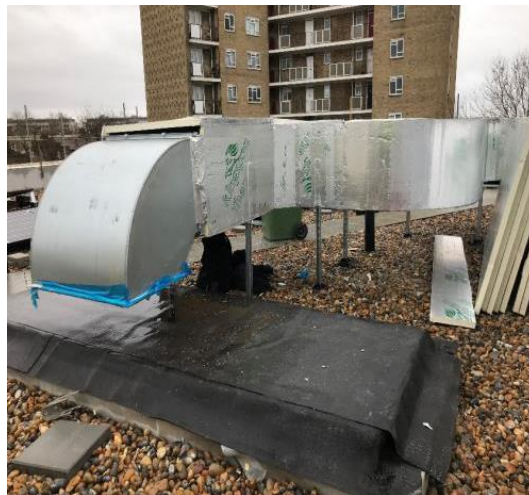
Figure 11 - insulation around roof ducting

The roof ductwork falls under Requirement B3 and B4 as it is situated on the roof and will penetrate the roof construction, requiring fire stopping.