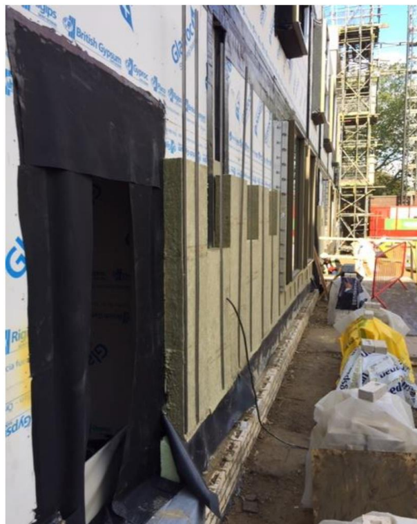
Figure 7 - Wall Insulation-Duo Slab

Rockwool Rainscreen-Duo Slab and RWA45 mineral wool insulation products are used to insulate all external walls from the ground level, up to the top of the walls at roof level. This product is non-combustible and is in line with ABD section 9. 2010 (as amended 2019).