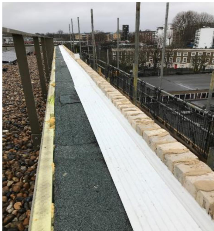
Figure 9 - Parapet on both schools capped on the top of the wall.

Between the Kingspan and the external wall surface there is the concrete upstand, mineral wool and brick finish. This is closed over the fire resistant cavity closer and then the roof upstand finish on top.