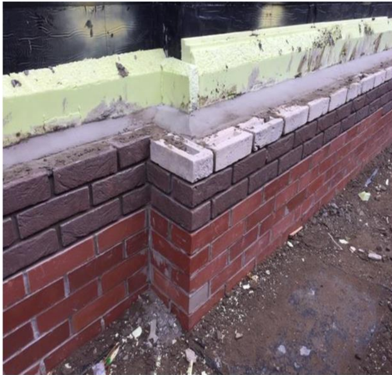
Figure 3 - Greenguard encapsulated in between brick and block