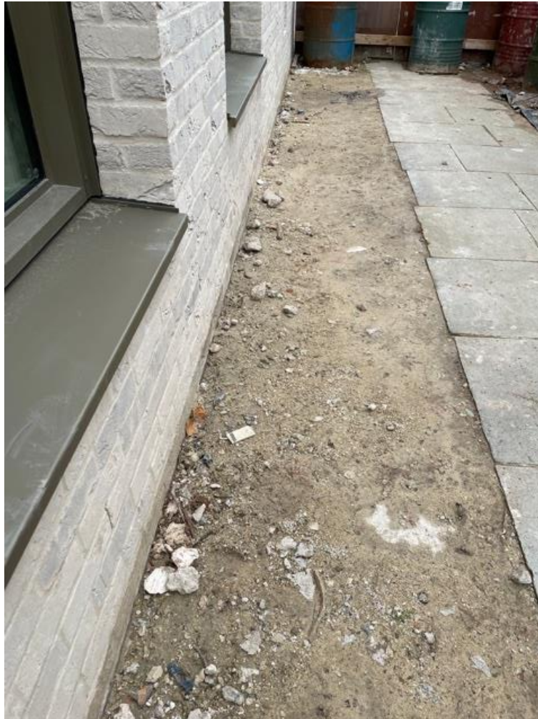
Figure 4 - Finished area