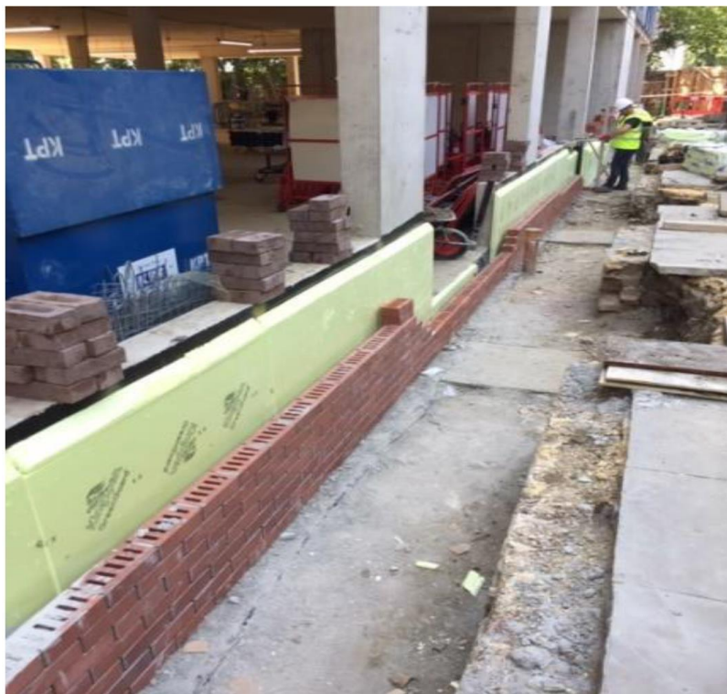
Figure 2 - Greenguard GG300 insulation installed at low level.

Figure 2 show the encapsulation of the GG300 and figure 4 show the appearance after completion. The GG300 is incapsulated between block work on the inside of the building and brick on the outside, the cavity in between the brick and block will be filled by the GG300 and capped with cement, figure 3 below. This arrangement will make the use of the GG300 in accordance with ADB section 9.10 2010 (as amended 2019).