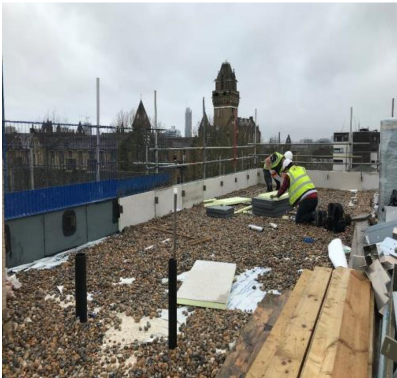
Figure 8 - GG300 under the stones on the roof

slab will stop fire spread from below and the external wall construction at roof level prevents fire from being able to spread to the inside of the roof upstand. The roof has been constructed in accordance with ADB 2010 (as amended 2019).