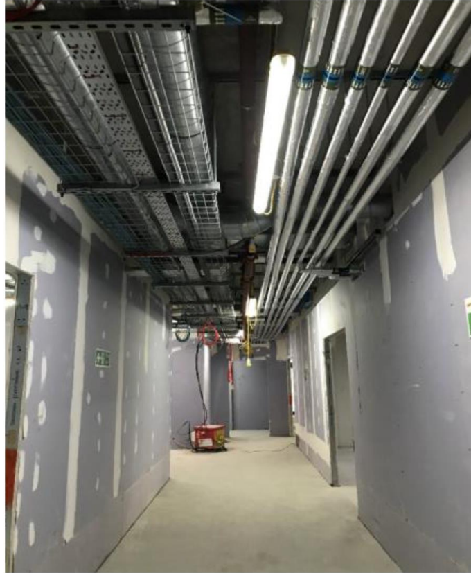
Figure 10 - Insulation on the Piping